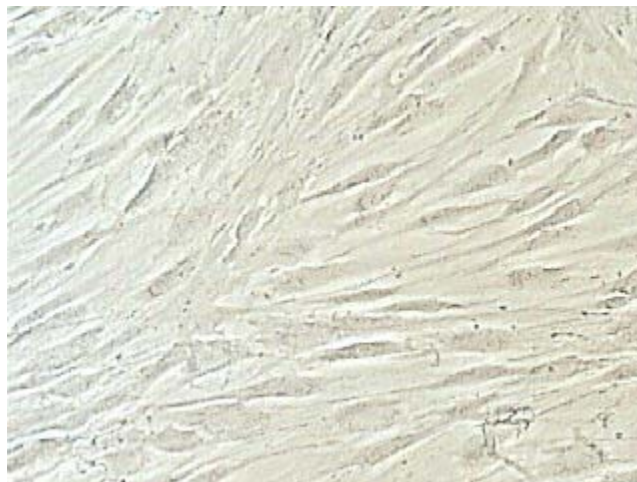
Figure 1. Mesenchymal stem cells in culture.

Immunophenotyping. At the end of the last passage, surface expression of CD166, CD105, CD44, CD13 (MSC markers), CD34, CD45 (HSC markers) and CD31 (endothelial cell marker) were determined in culture-expanded MSCs. Anti CD44, CD45, and CD34 fluorescein isothiocyanate (FITC), anti-CD13 and CD31 phycoerythrin (PE) all from Dako (Denmark), anti CD166 FITC and anti CD105 PE were purchased from Serotec (Italy). Relevant isotope control antibodies were also used. Flow cytometry was performed on a FACScan (Becton Dickinson) and data were analysed with Cellquest software. Typical flow cytometry profile and Immunohistochemistry staining of MSCs isolated from this study are shown in figures 1-3.