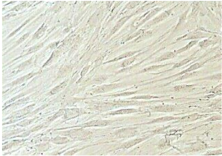
Figure 1. Homogenous monolayer of BM MSC culture