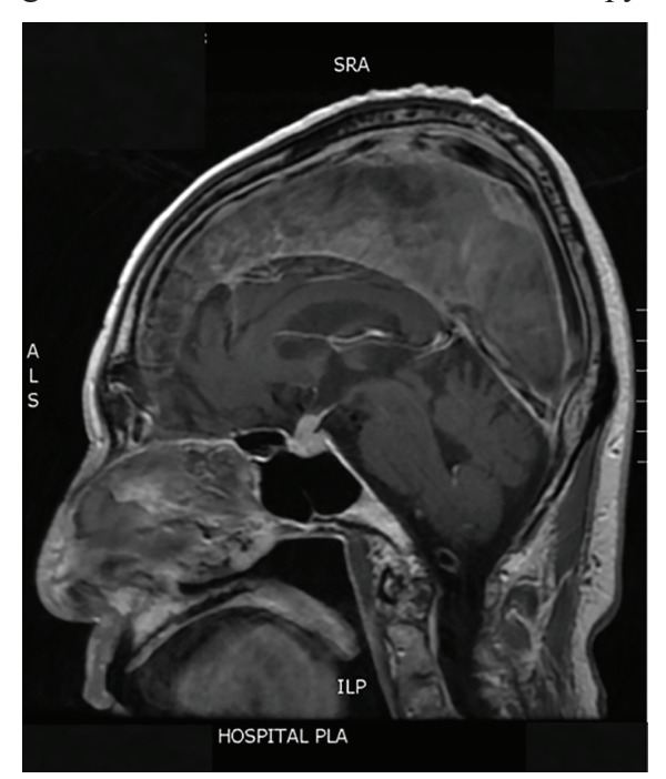
Fig. 2. MRI indicated pituitary hypertrophy and thickening of pituitary stalk.

Gamma globulin, leflunomide, and glucocorticoids were utilized in therapy.