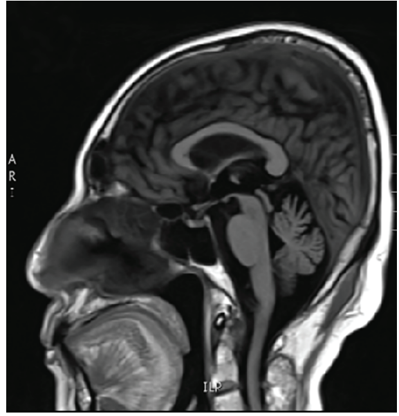
Fig. 3. MRI indicated the pituitary gland significantly shrank after 6 months of treatment.

The patient did, however, have to endure nausea, tiredness, loss of appetite, and other symptoms during the hormone reduction process due to the relative absence of adrenocortical activity. These symptoms were alleviated after the hormone dosage was increased appropriately. Fig. 4 depicts the progression of the diagnosis, the course of treatment, and the prognosis in this case.